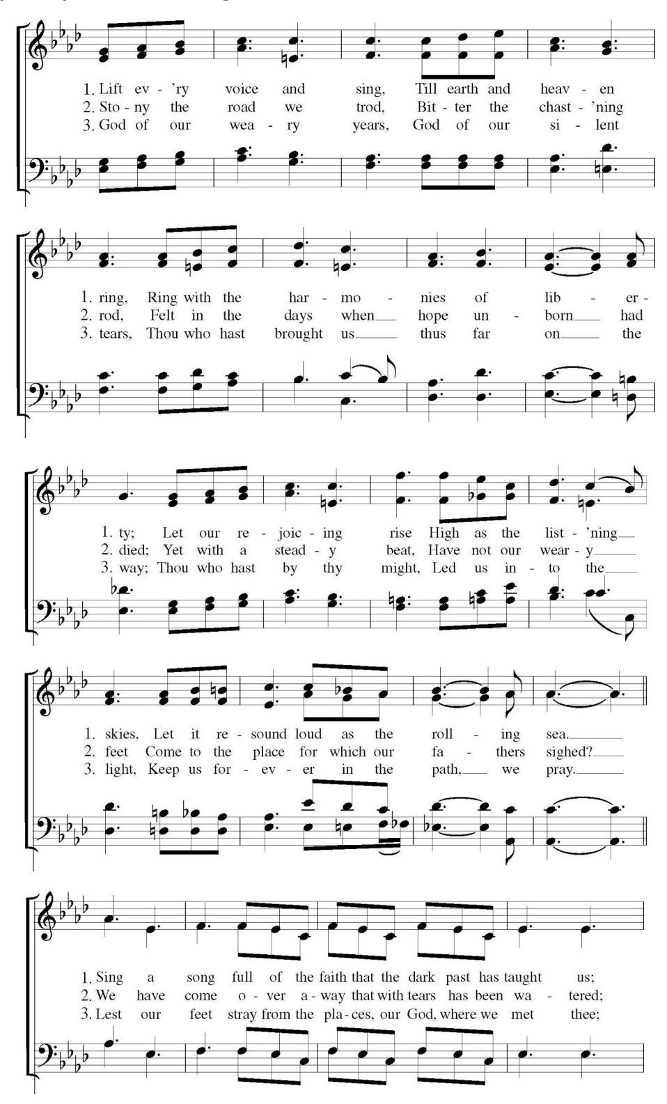
Hymn: Lift ev'ry voice and sing